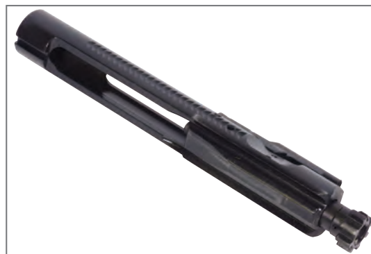
Synthetic Firearm Lubricant provided exceptional performance over rigorous range testing in multiple firearm applications.