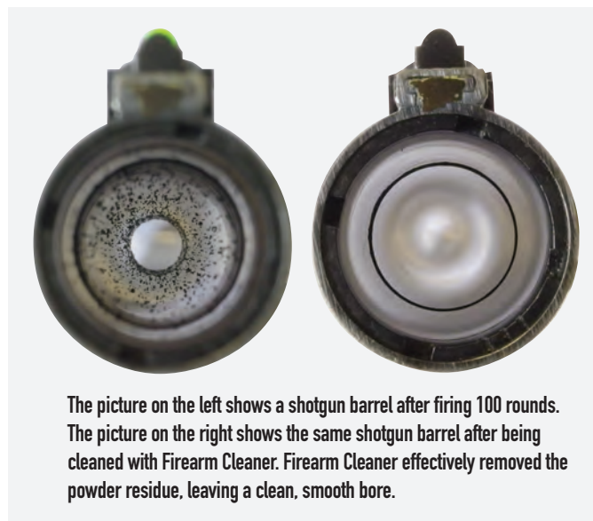
The picture on the left shows a shotgun barrel after firing 100 rounds. The picture on the right shows the same shotgun barrel after being cleaned with Firearm Cleaner. Firearm Cleaner effectively removed the powder residue, leaving a clean, smooth bore.

AMSOIL products are backed by a Limited Liability Warranty. For complete information visit AMSOIL.com/warranty.aspx .