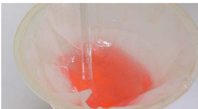
Wax formation in untreated diesel fuel plugs a coffee filter.