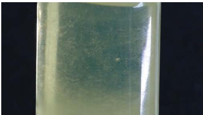
Wax crystals in untreated diesel fuel. The wax crystals will eventually fall out of solution and plug the fuel filter.