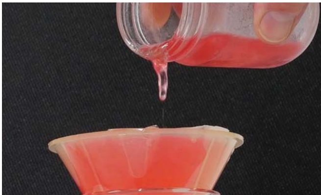
Wax formation in untreated diesel fuel resists pouring.

lowers the cold filter-plugging point (CFPP) by up to 40°F (22°C) in ULSD.